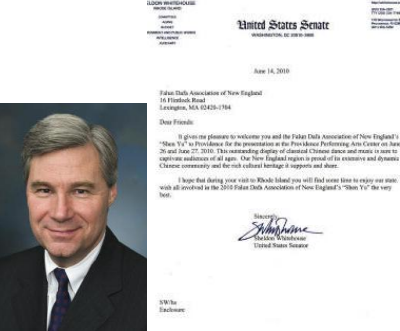
Congratulatory letter from US Senator Sheldon Whitehouse

Issues Certificate of Special Congressional Recognition