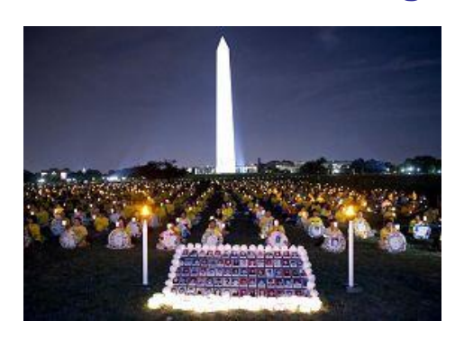
Falun Gong practitioners from around the world gathered at the Washington Monument in Washington DC on July 22, 2010, to mourn practitioners in China who have lost their lives in the persecution of Falun Gong.

(Clearwisdom.net) On the evening of July 22, 2010, more than a thousand Falun Gong practitioners from around the world participated in a candlelight vigil in front of the Washington Monument to commemorate practitioners in mainland China who have died as a result of the persecution.