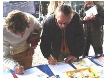
Passersby sign the petition to condemn the persecution

Another German woman told the practitioner that she had learned about the illegal organ harvesting two years ago. Both she and her son were shocked to learn that it was still going on. "We thought it would be over by now. I can't believe it is still happening. Why hasn't Germany, a responsible great power, done anything to stop the persecution? I can't understand and I am very sorry."