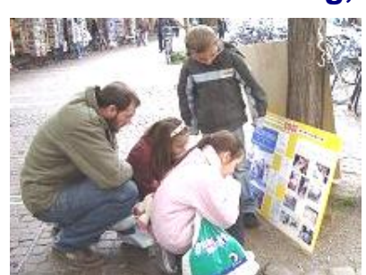
A family reads the posters about Falun Dafa

(Clearwisdom.net) Falun Gong practitioners in Germany and Switzerland gathered in Freiburg, Germany on October 23, 2010, to expose the persecution of Falun Gong in China. Many passersby signed a petition condemning the persecution, and some expressed interest in learning the practice.